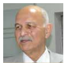
Senator Mushahid Hussain Syed

The gathering was addressed as chief guest by Senator Mushahid Hussain Syed,