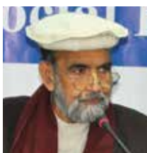
Prof Dr Qibla Ayaz

Islamic social protection system fulfills multiple SDGs and serves as an excellent tool for building resilience and equilibrium in social and economic lives. For that, effective reforms at the legislative, constitutional, and operational levels