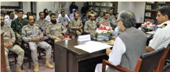
Participants of the 52 nd PN Staff Course at Pakistan Navy War College (PNWC), Lahore, visited IPS on October 5, 2022, to get exposure to independent think tanks, their role in the contemporary world as well as in enhancing