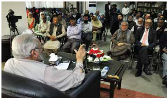
A family get-together (of IPS Team and Associates) cum interactive session with the

honourable founding chairman of IPS, Professor Khurshid Ahmad, was held on March 23, 2017 to celebrate 'Pakistan Day' and talk about his memories of the independence movement, the making of Pakistan and his life-long contributions for the country and the Muslim world.